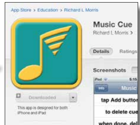
The two apps shown above are available in the App Store. Class Cards is not yet iPad native, so you'll need to search for an iPhone app called Class Cards.