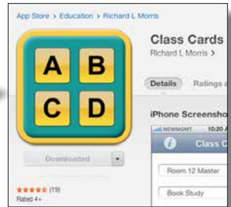
Class Cards Teaching Tool for Student Engagement $4.99